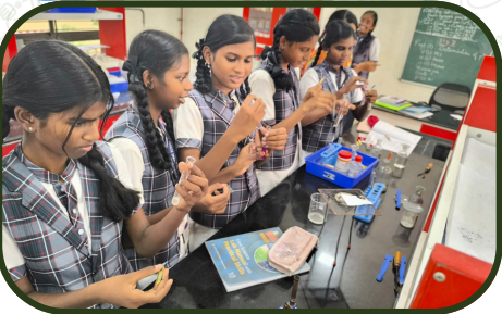
02 CHEMISTRY LAB