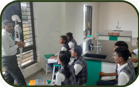
03 BIOLOGY LAB