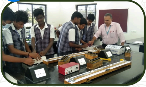
01 PHYSICS LAB