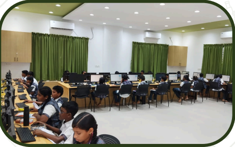
04 JR. COMPUTER LAB